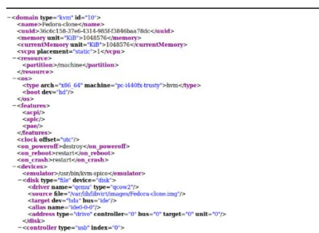
Fig 3. Snippet of XML file of a virtual machine

The following snippet shows a template of xml file used in the implementation: